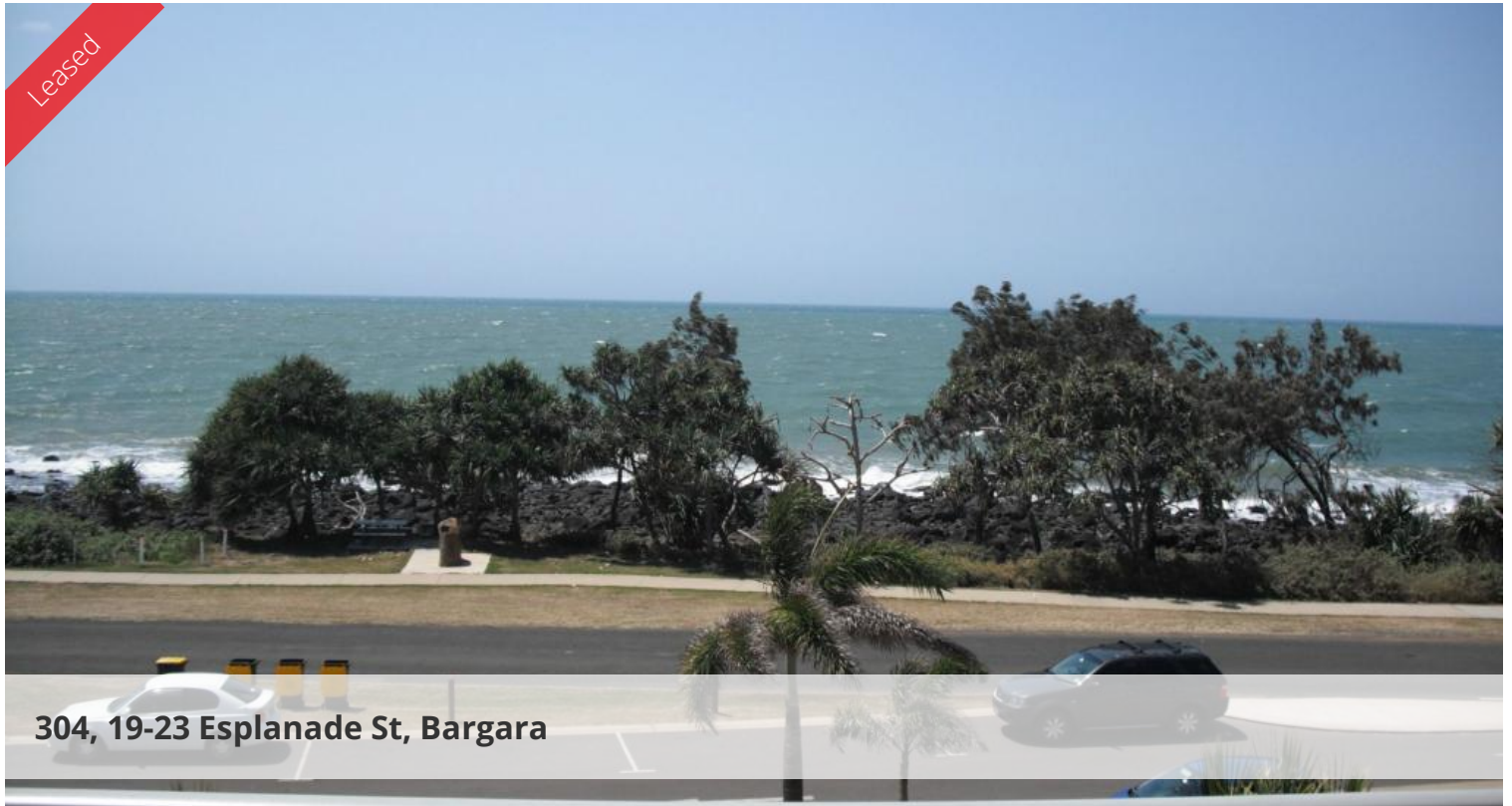
304, 19-23 Esplanade St, Bargara