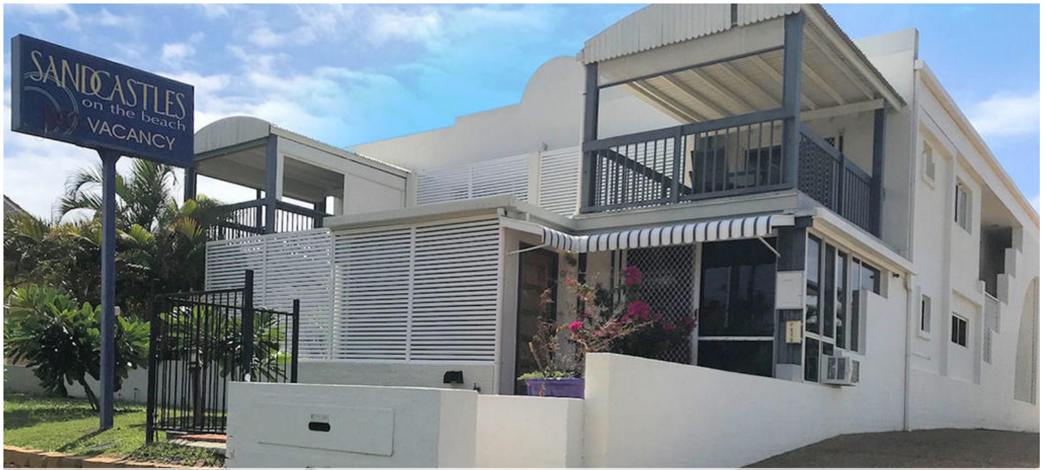
Unit 7, 82 Miller St, Bargarra