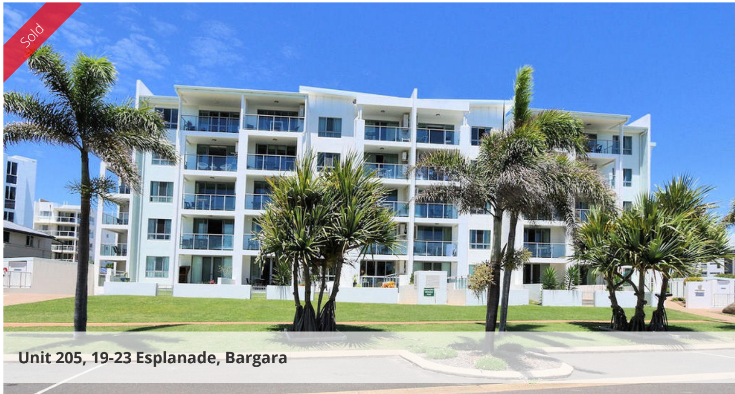
Unit 205, 19-23 Esplanade, Bargara