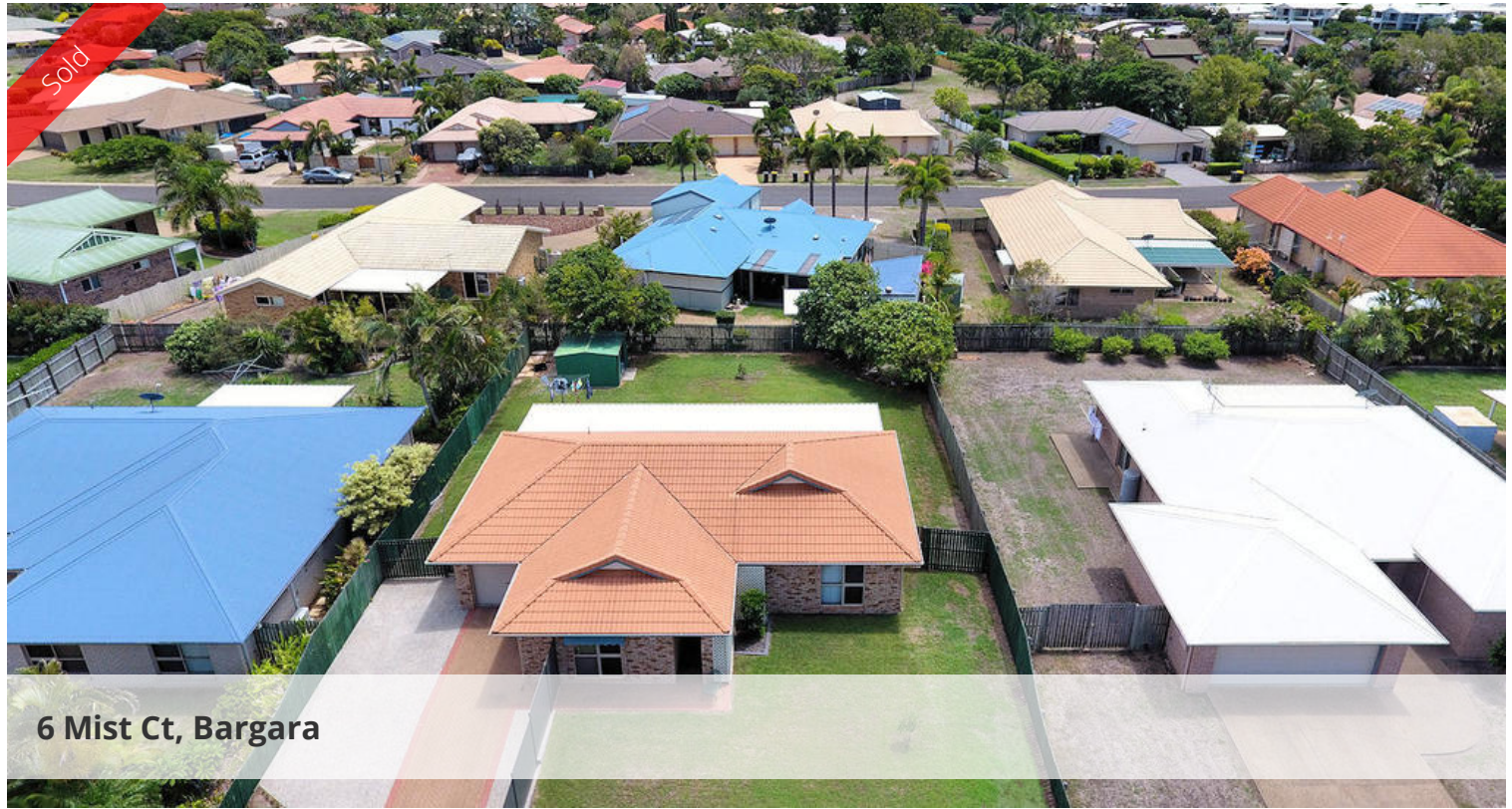
6 Mist Ct, Bargara