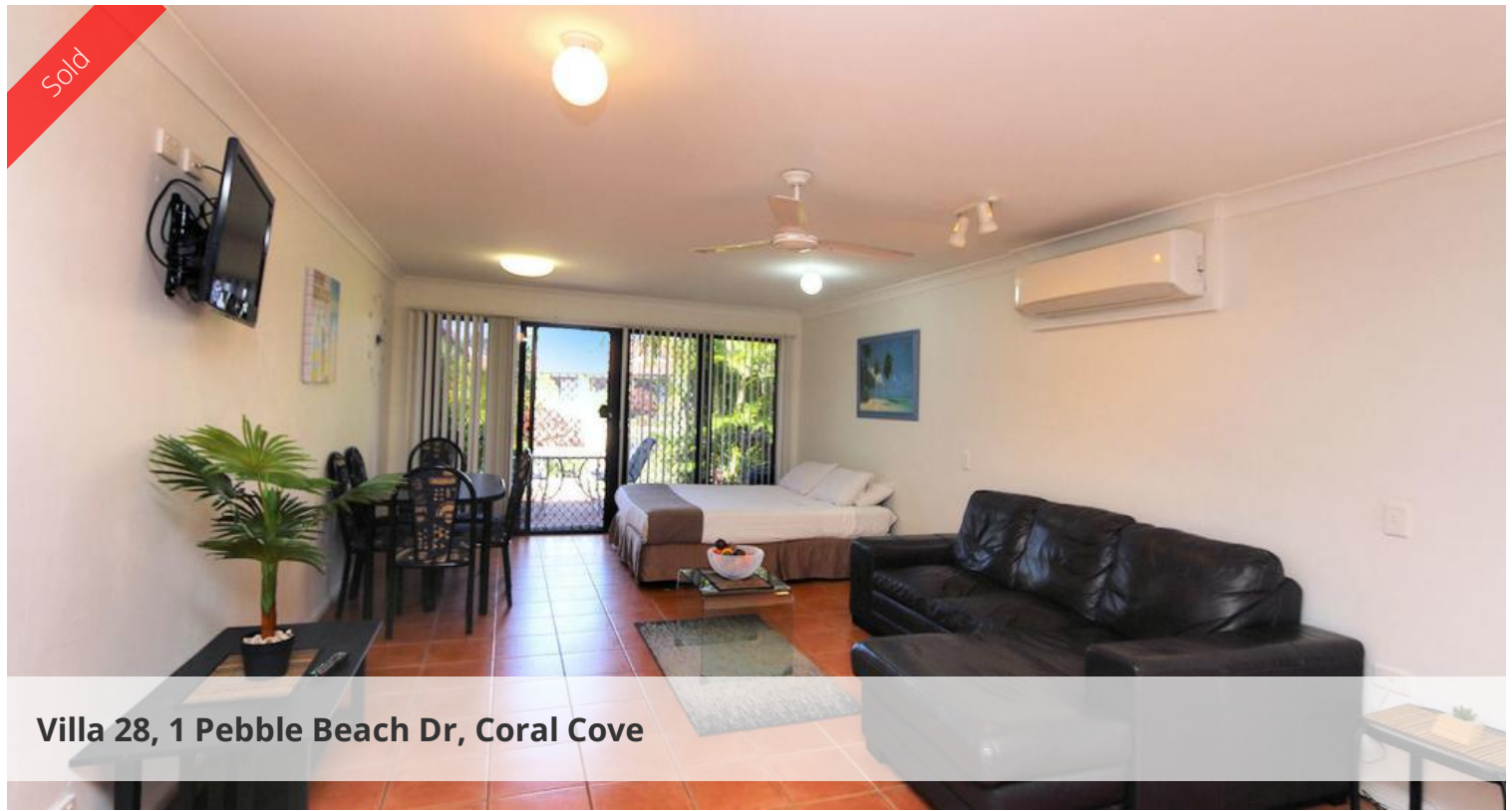
Villa 28, 1 Pebble Beach Dr, Coral Cove