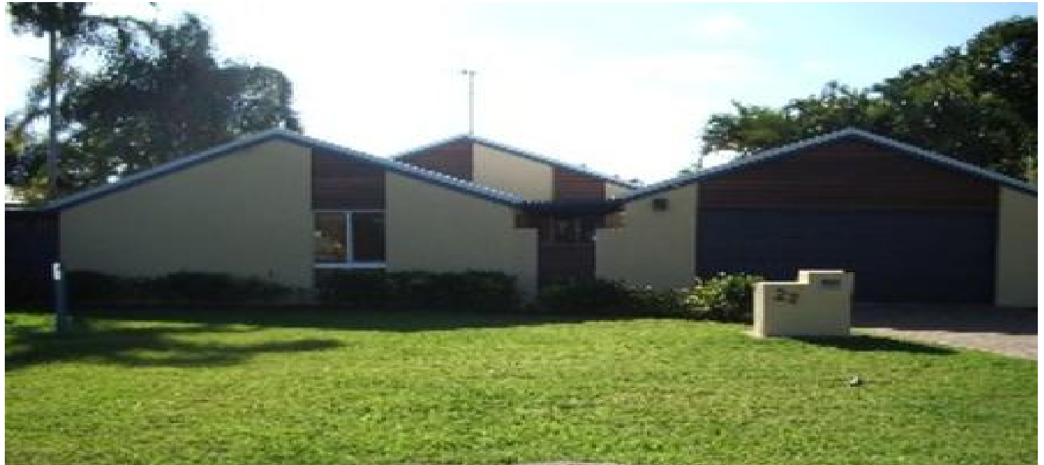
22 Bussey Street, Bargara